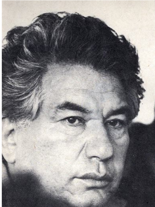
Chingiz Torekulovich Aitmatov: 12 Dec 1928 – 10 June 2008